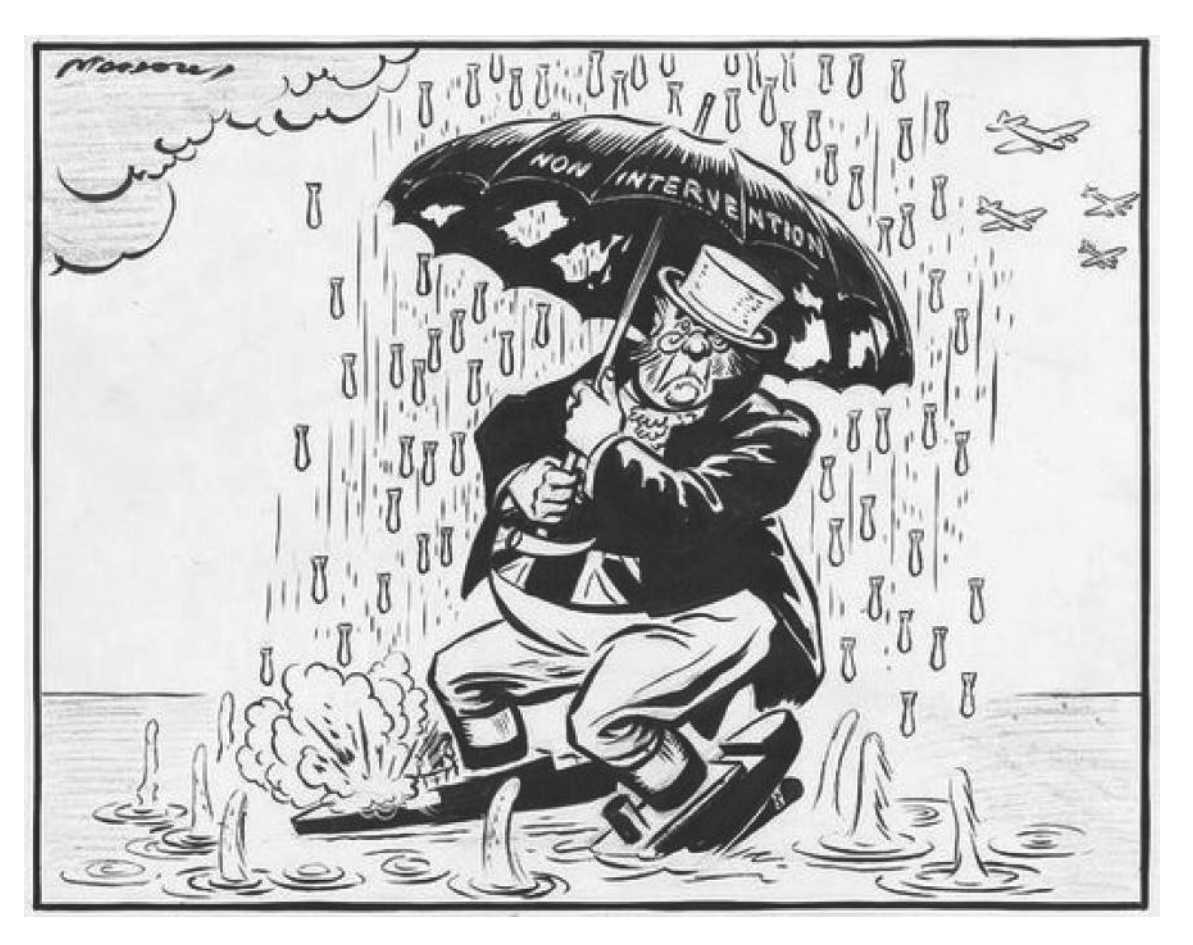
An Australian cartoon published in June 1938. The man represents Britain.